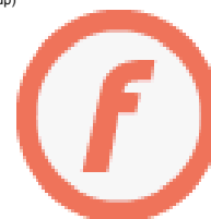
practice and group